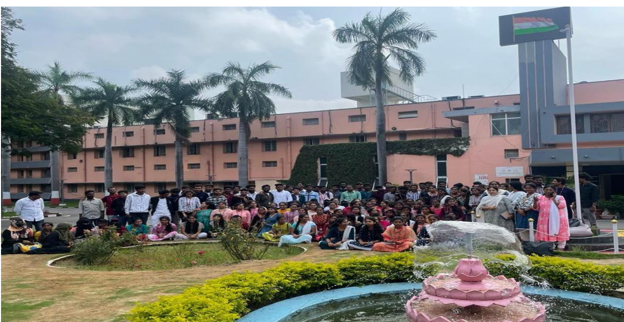
Degree Final Year Food science and technology and Nutrition Students visited ICMR-National Institute of Nutrition, Hyderabad.