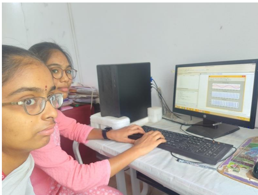
Understanding MATLAB Coding using MATLAB Software

Experiential learning constitutes a systematic approach to acquiring knowledge through direct experience, observation, and reflective analysis. This process encompasses: actively participating in an experience that adheres to a scientific methodology or is designed with technical or experimental considerations. Additionally, it involves contemplative examination of the events and outcomes observed during the experience.