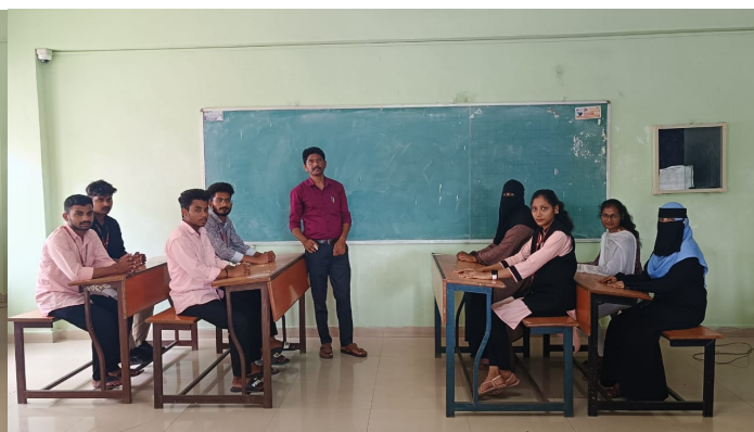
GROUP - C&D

RESULT: All groups showed keen interest in the competition and finally group-A was the winner and group-B was the runner-up team.