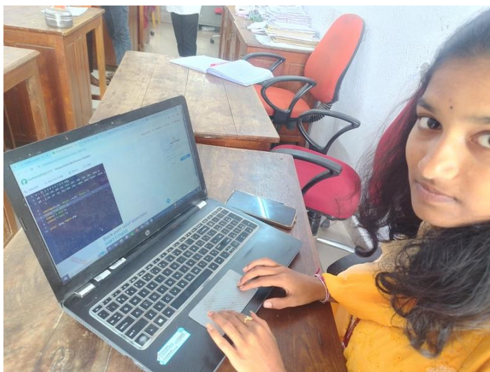
Understanding assembly language programming for 8085 microprocessor using online simulation