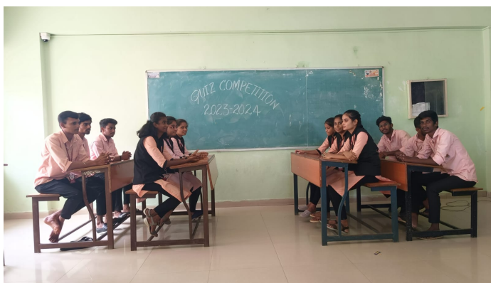
GROUP - A&B