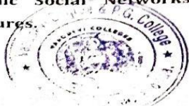
Principal Vaagdevi Degree & P.G. College Kishanpura, Hanamkonda

Research Publications are assets to Faculty and Research Scholars who wish to excel in the career of Teaching and Research. Research publications speak the progress of the Faculty/Researchers. Due to wide availability of various publishers, many of times Faculty and Research Scholars are often find difficulty to identify a good journal/publisher to publish their research outcomes. The proposed workshop provides an ideal avenue for the Faculty members & Researchers to understand the avenues for Research Publications. The workshop provide good learning experience about publishing papers in journals improving citations for research articles, Increasing the research aptitude through Academic Social Networks(ASNs) and evaluating the Plagiarism through ethical procedures.