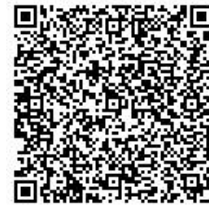
Girish V. Nandimath Global Head Talent Acquisition & AIP

Click here or use a QR code scanner from your mobile to validate the offer letter