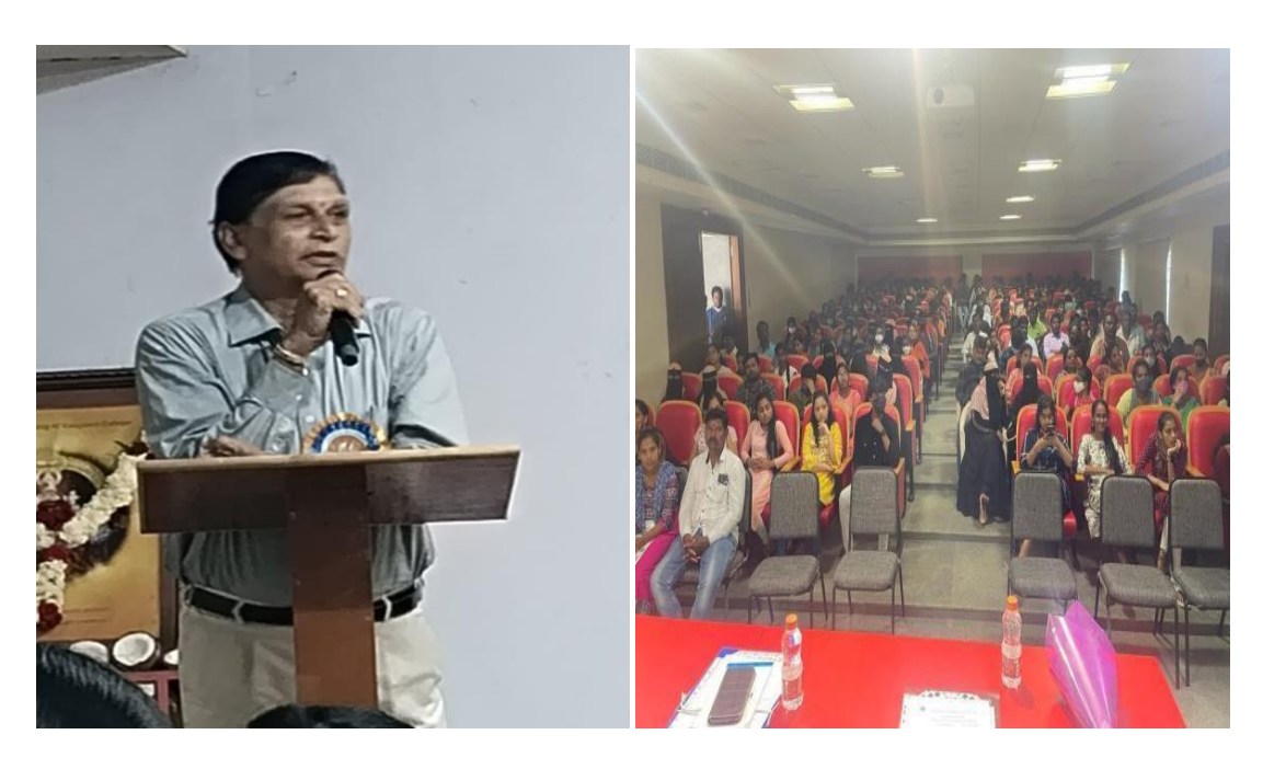
Prof. Girisham addressing the students regarding importance of literate women

It is very important that women are fully educated. Literate mothers, grandmothers, aunts and sisters make for families where everyone has the benefit of a good education. The means that the younger children will grow up in a family where education is not only valued but is seen as essential.