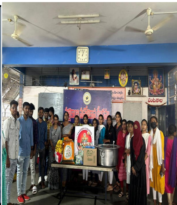
Handing over the Rice bags

Mallikamba Manovikasa kendram is an institute for rehabilitation of mentally challenged students. They have both day scholars and boarders. It is a non Government organization running on charities from benevolent people.