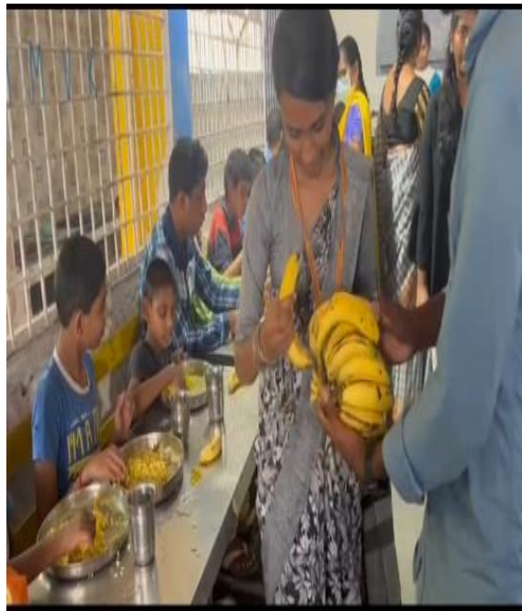
Distribution of fruits by faculty and students

Visited organization : Mallikamba Manovikasa kendram Type of Activity : Distribution of fruits, biscuits, rice No. Of students : 119 Date : 10.10.2023