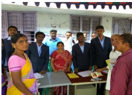
Helping the village people in downloading APPS and applying for beneficiary schemes