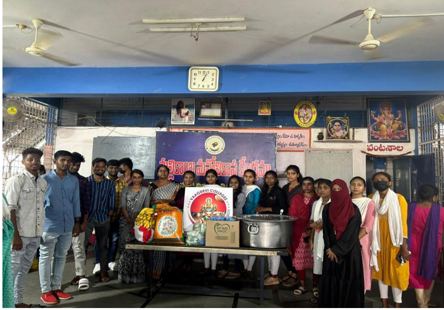
The students of Degree college at Mallikamba Manovikas kendram