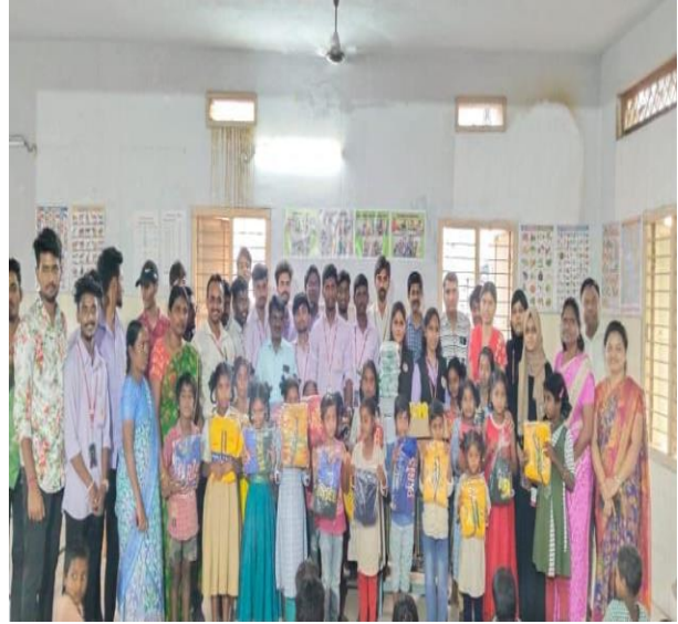
Slum children's schools