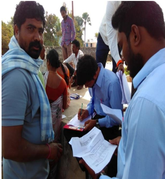
Helping the village people in downloading APPS and applying for beneficiary schemes