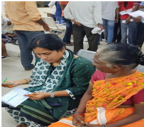
Customer requesting help from the students Faculty helping the customer in opening an account.