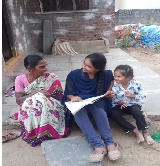
Helping elder people with alphabet