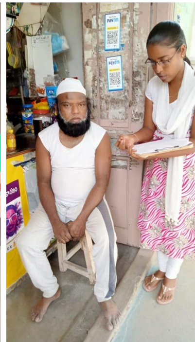
Creating awareness related to healthy eating & Cleanliness