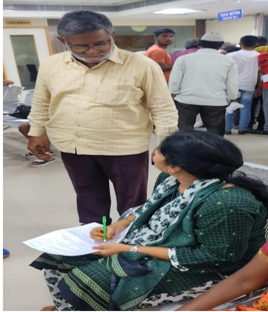
Students enquiring about bank transactions Creating awareness on applying for Demand draft