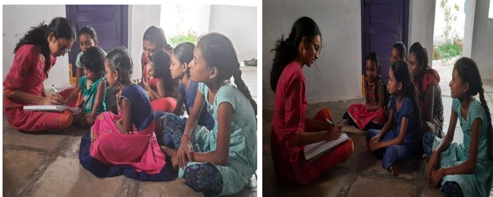
Helping illiterate Children

We have been encouraging the students to go in for various individual efforts as Brand Ambassadors of our college. The students come from various districts and villages around Hanumakonda. It is helping to develop a sense of empathy towards others and also develop philanthropy among them. Students are being given tasks to promote literacy campaign among poor children and elders too.