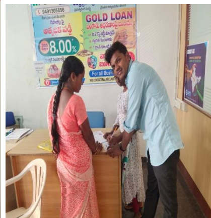
Creating customer awareness