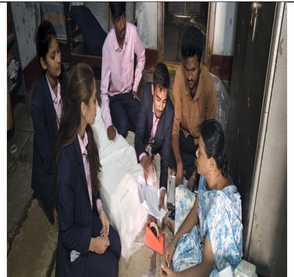
Creating awareness among single women regarding ensuring that each transaction for payment should be checked and verified.

Students are creating awareness to elderly people regarding avoiding OTP details sharing to unknown callers.