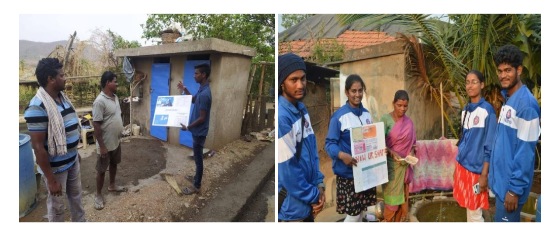
Importance of health benefits of using Toilets