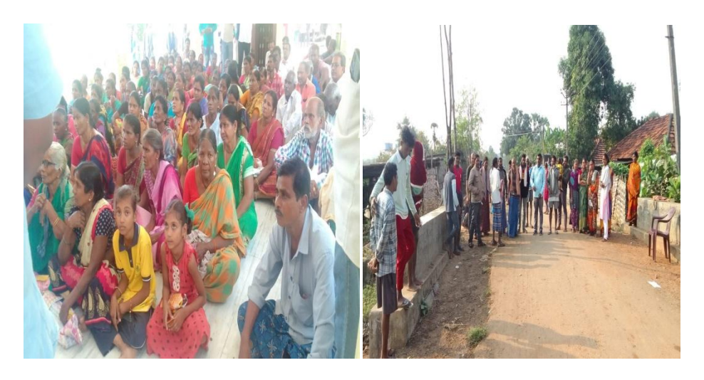
Creating awareness regarding keeping the surroundings clean