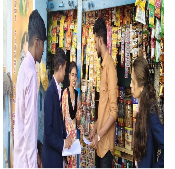
Creating awareness regarding ensuring that each transaction for payment should be checked and verified