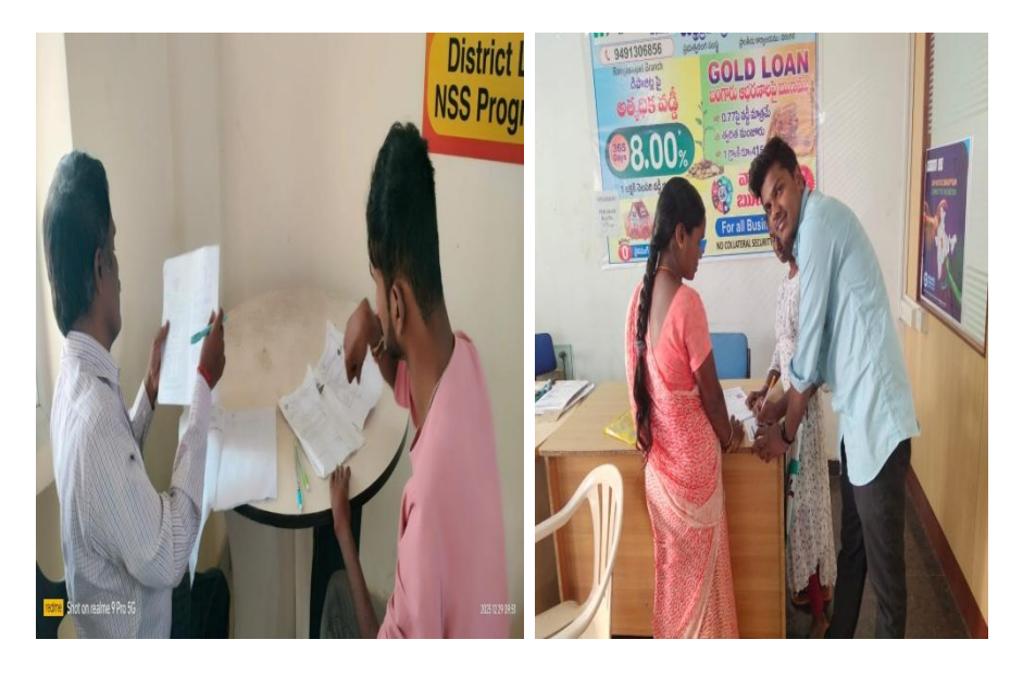
New account opening details