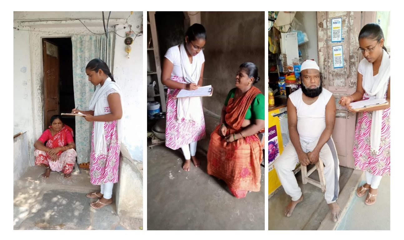
Creating awareness related to healthy eating & Cleanliness