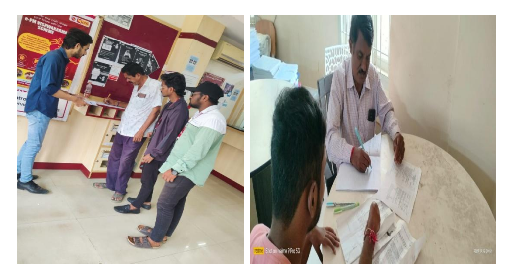
Creating Customer awareness-Regarding bank transaction