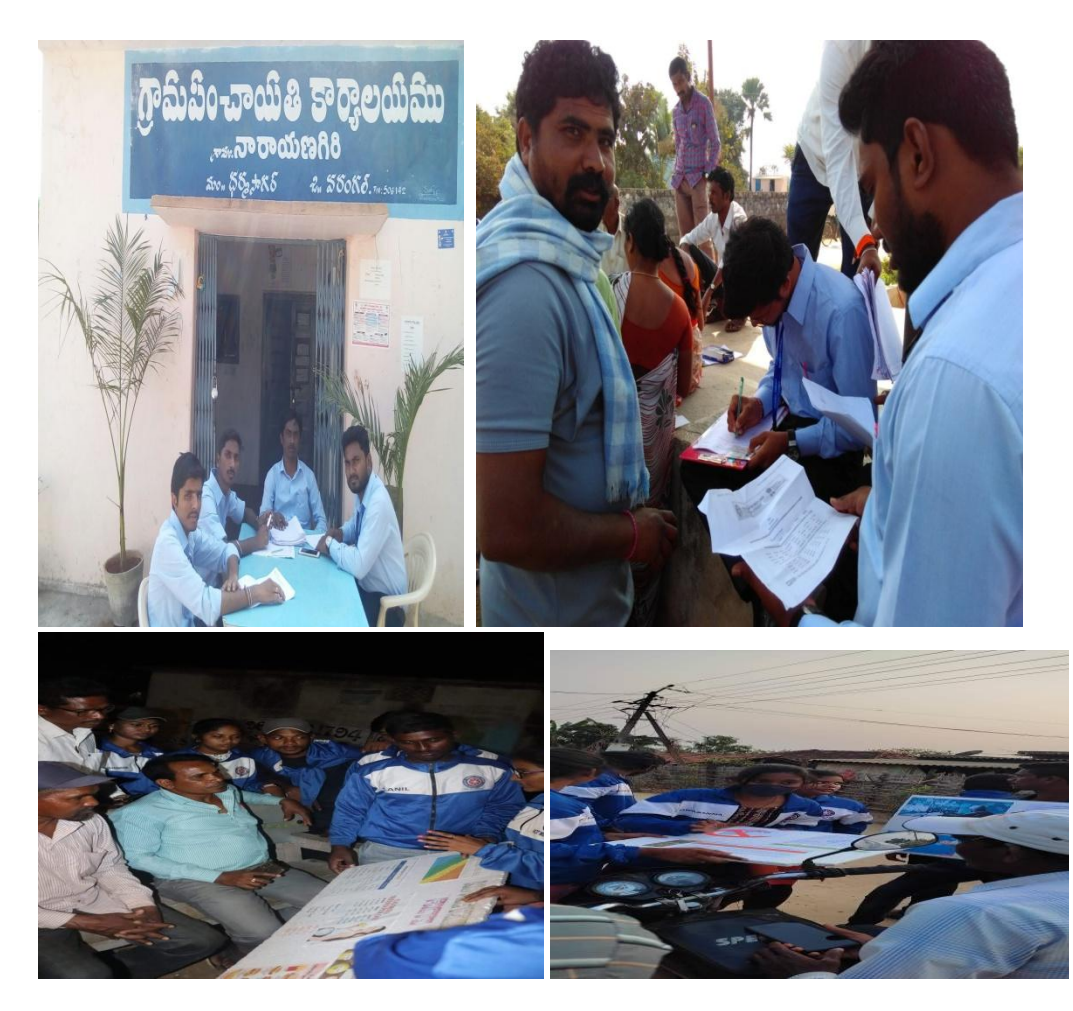
Helping the village people in downloading APPS and applying for beneficiary schemes