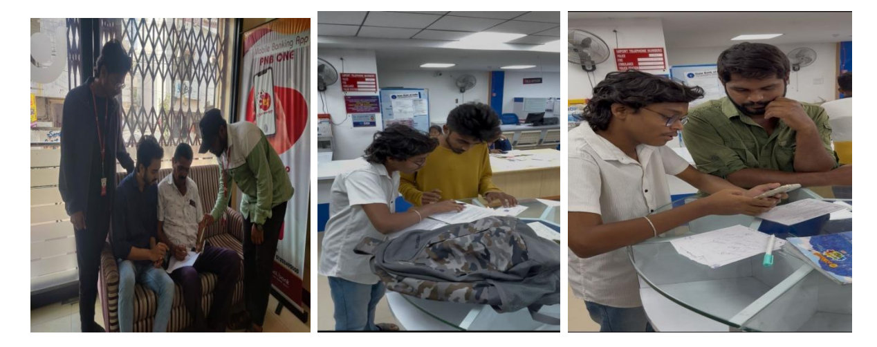
Creating customer awareness

Students enquiring about bank transactions Creating awareness on applying for Demand draft