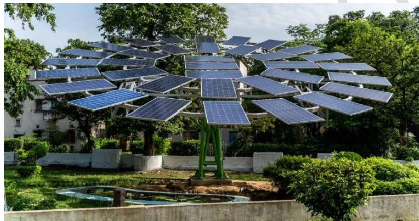
Plate 1: Solar tree concept for the Institute (For reference purpose only)

Since there is availability of space; the solar trees can be installed in multiple places as they will provide dual benefits of aesthetic and energy reduction.