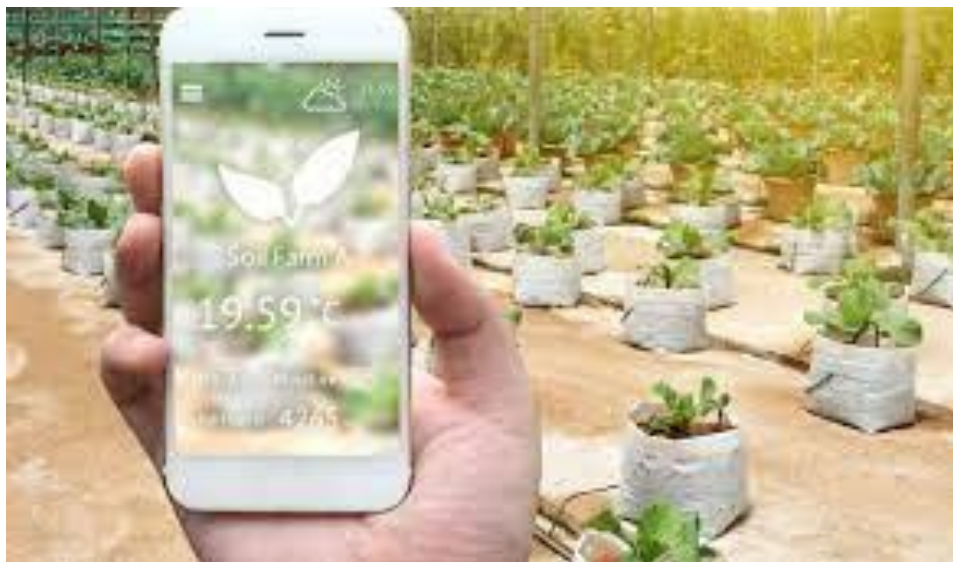
Plate 3: Solar farm concept for the Institute (For reference purpose only)

The Institute can undertake a Smart Gardening system using IoT Technology. This will result in saving time by scheduling time for watering; saving money through automated water schedules tracking dampness of soil to know when, how much water garden needs.