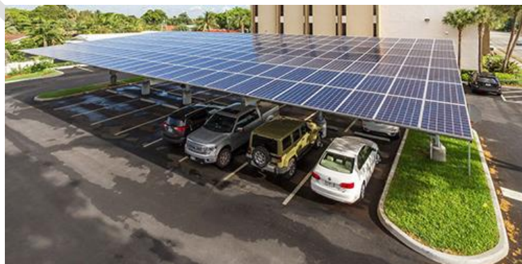
Plate 2: Solar parking concept for the Institute (For reference purpose only)

The Institute can turn its existing parking areas into solar panel powered parking areas. This will provide shade and renewable energy benefit to the Institute.